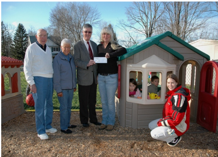
Presentation of check to Hawley Head Start.